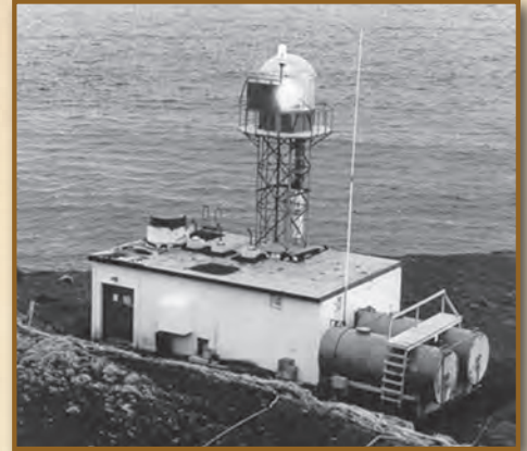
INT R XXX"

Hoping to find survivors, a search party was greeted with a grisly scene of destruction when they arrived at the location the following morning. The station had been swept into the sea with only the jagged bones of the concrete structure jutting up from the bare rock.