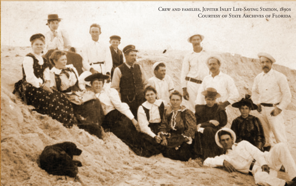
CREW AND FAMILIES, JUPITER INLET LIFE-SAVING STATION, 1890S