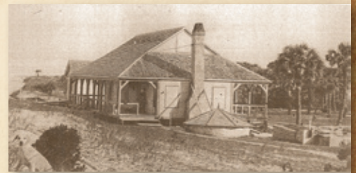
INDIAN RIVER INLET HOUSE OF REFUGE

with the four ground-floor rooms being for the keeper and his family. The second floor was used to house shipwreck victims. Each station could hold as many as 25 persons for up to 10 days. The houses had no glass windows, but each window did have wire-gauze "mosquito netting" and shutters that could be closed in bad weather. Each house was also provided with a cistern for water and a small boat house for the supply boat.