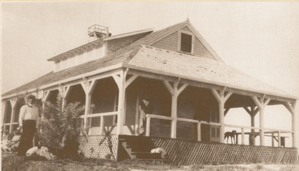
MOSQUITO LAGOON HOUSE OF REFUGE

At about the same time, the Life-Saving Service determined that Florida would