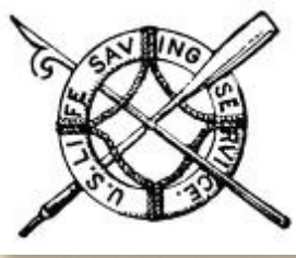
LOGO OF THE US LIFE-SAVING SERVICE