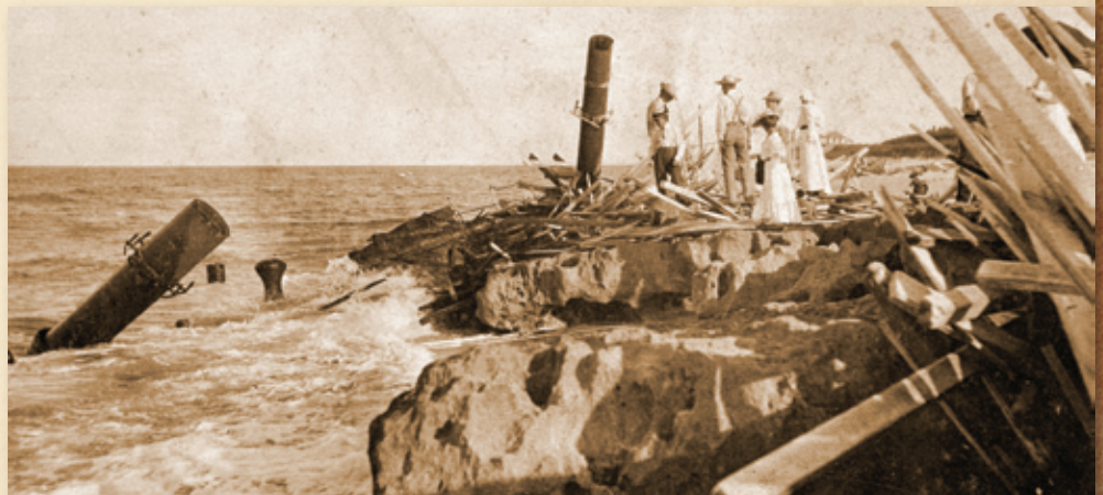
SHIPWRECK NEAR GILBERT'S BAR HOUSE OF REFUGE.