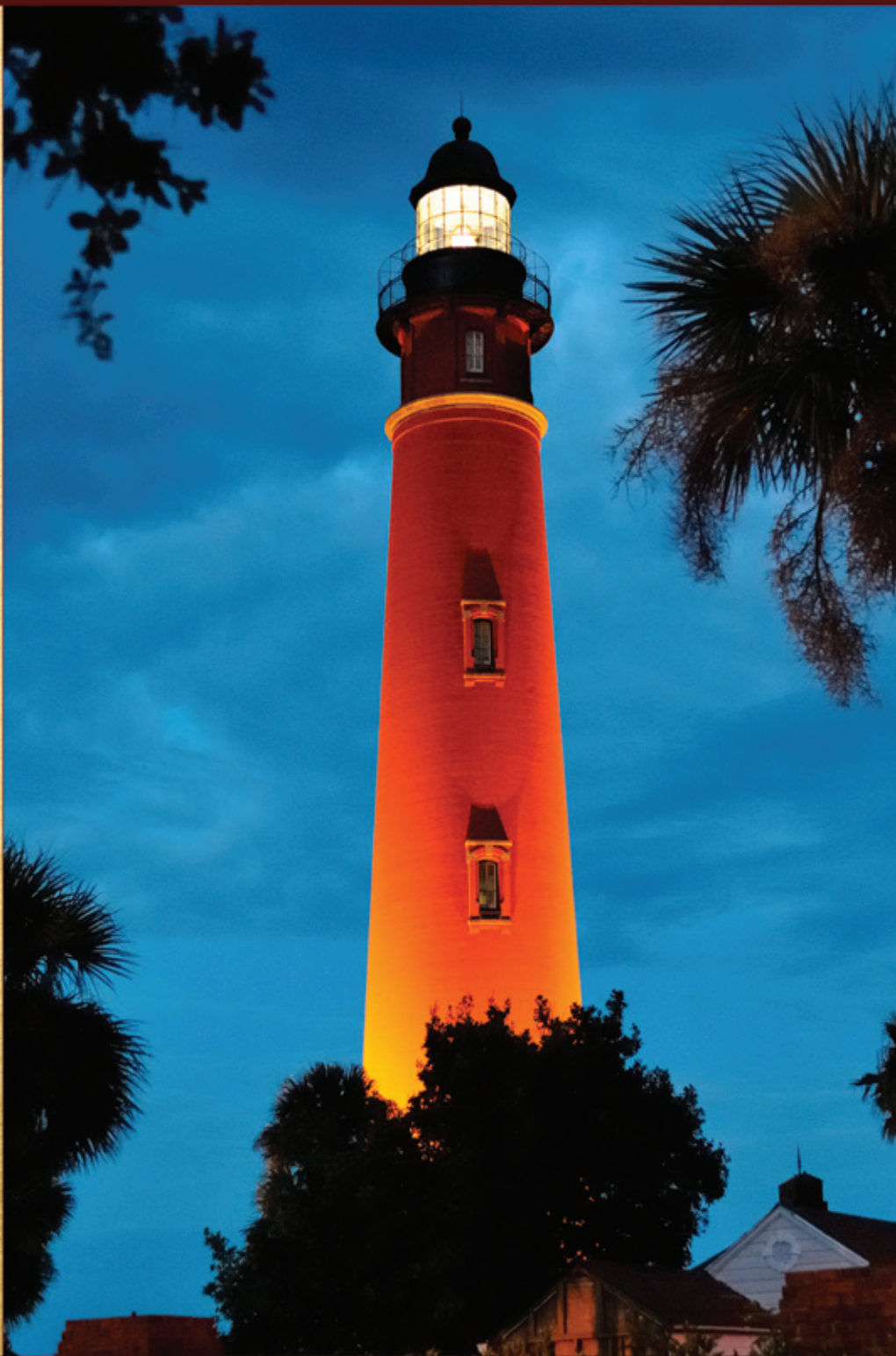
PHOTO COURTESY OF RON CHRISTOPHER. PRINTS AVAILABLE ONLINE AT WWW.PONCELIGHTHOUSESTORE.ORG