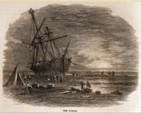
FLORIDA SHIPWRECK, 1864 ETCHING.