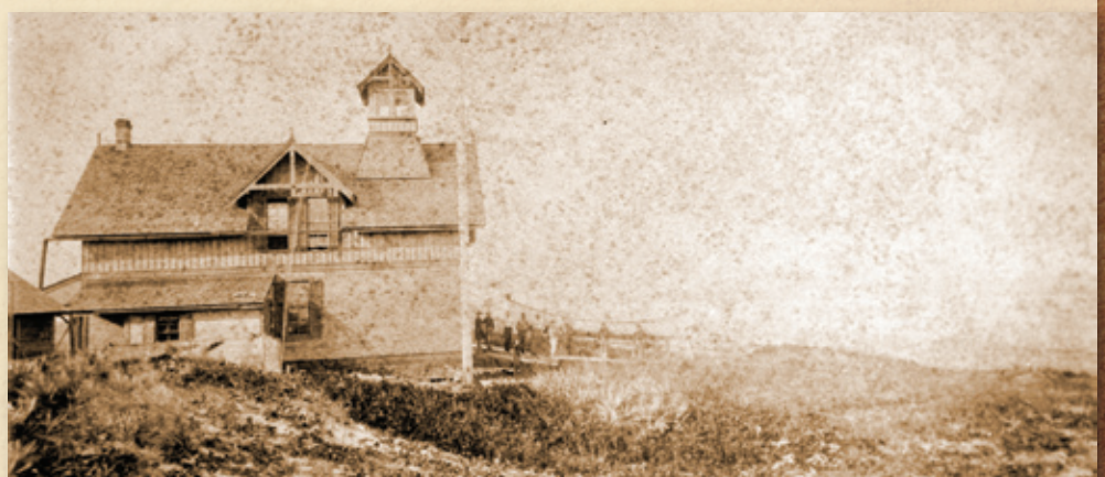
JUPITER INLET LIFE-SAVING STATION, c. 1912.