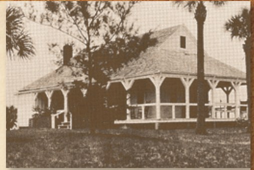
CHESTER SHOAL HOUSE OF REFUGE

The first five houses of refuge in Florida were constructed in 1875. The contract for these was awarded to Albert Blaisdell of Boston. The houses were numbered 1-5, with house number 1 located at Bethel Creek, number 2 at Gilbert's Bar, number 3 at Orange Grove, number 4 at Ft. Lauderdale, and number 5 at Biscayne Bay. All of the houses had to be completed by April 1, 1876, or the contractor would be fined $30 for each day past the deadline. Blaisdell was to be paid $2,900 for each house, and he would receive his first partial payment only after two houses had been completed and had passed inspection. The plans were standard Life-Saving Service designs, possibly drawn by Francis Ward Chandler, an architect for the Treasury Department. All the houses were very similar. Each had two stories,