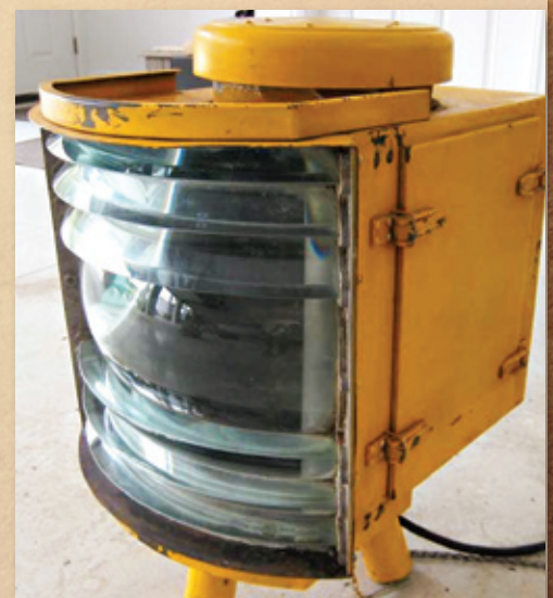
SPERRY AGA BEACON BEFORE RESTORATION

the World's Most Famous Beach where automobile and motorcycle racers also flew their planes for fun and competition.