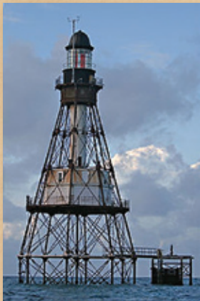
FOWEY ROCKS LANTERN ROOM

design and construction. In most cases, ascribing the plans to any single individual would be a mistake. We now know that the Mosquito Inlet Light Station tower was derived from standard plans and that the lantern room design was borrowed from standard plans used at Florida's Fowey Rocks Lighthouse. The dwellings were also modifications of standard plans. The oil house, being one of the largest ever built and being one of the earliest designed to store kerosene, may be the most unique structure at the Light Station, but even this building has its origins in previously used Light-House Board designs. As for Francis Hopkinson Smith, his lighthouse career included many important projects but not the one at Mosquito Inlet.