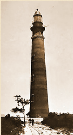
MOSQUITO INLET LIGHTHOUSE

both by coastal steamer and via the inland water route