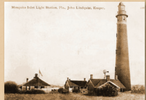
THE MOSQUITO INLET LIGHT STATION IN 1905