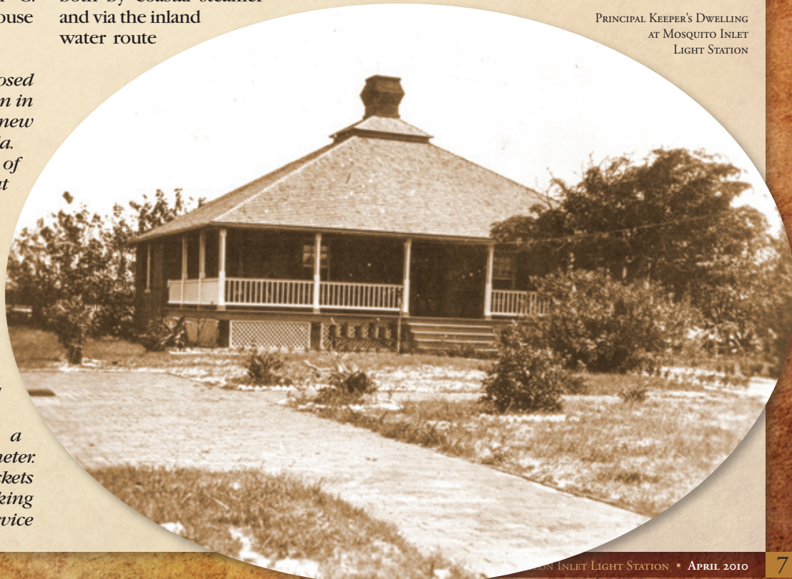
PRINCIPAL KEEPER'S DWELLING AT MOSQUITO INLET LIGHT STATION