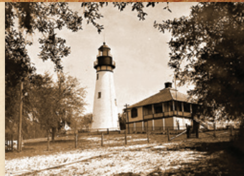
THIRD PRINCIPAL KEEPER'S DWELLING BUILT AT AMELIA ISLAND LIGHTHOUSE