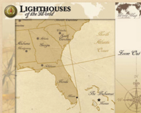
SOUTHEAST UNITED STATES