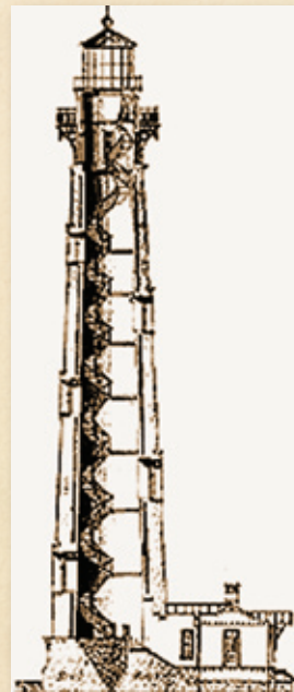
CUTAWAY OF CURRITUCK BEACH TOWER DESIGN

time that the Mosquito Inlet Light Station was being planned and constructed (1880-1887), Smith was not employed by the Light-House Board. Interestingly, from 1884-1890, Smith was working as a contractor for the Life Saving Service and was involved in the construction of five houses of refuge on the east coast of Florida. These included Smith's Creek, Chester Shoal, Cape Malabar, Indian River Inlet, and the Mosquito Lagoon House of Refuge, certainly another possible source of the confusion of Smith with the Mosquito Inlet Light Station. The houses of refuge built by Smith were from standard designs provided by the Life Saving Service.