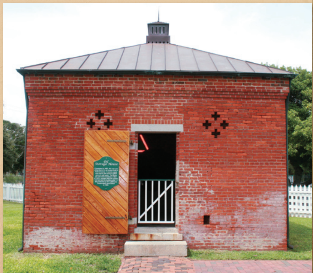
RESTORED OIL HOUSE AT PONCE DE LEON INLET LIGHT STATION