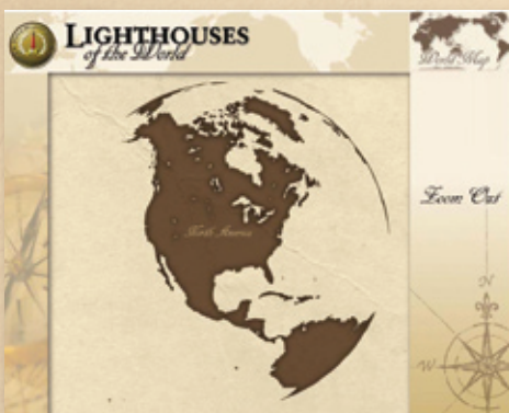
NORTHERN WESTERN HEMISPHERE