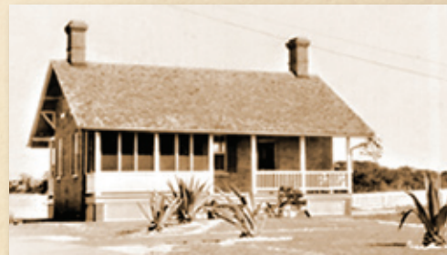
SECOND ASSISTANT KEEPER'S DWELLING AT MOSQUITO INLET LIGHT STATION