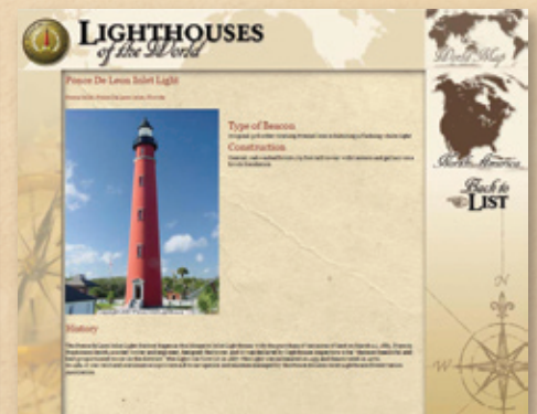
PONCE DE LEON INLET LIGHT STATION PAGE