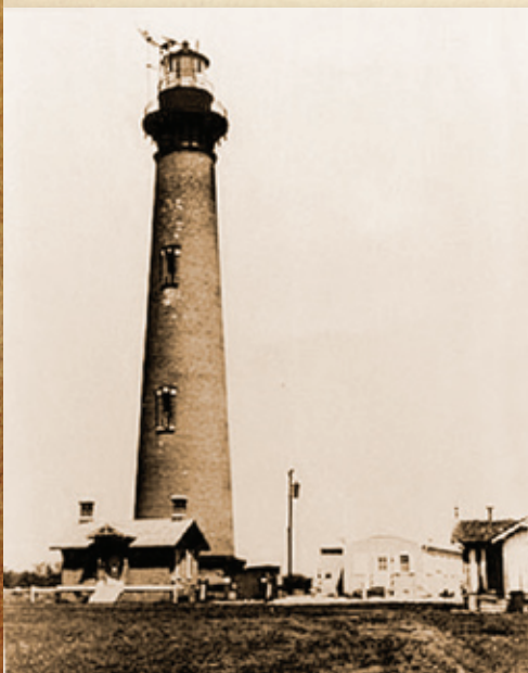
CURRITUCK BEACH LIGHTHOUSE

Within the Board were committees to advise and oversee operations such as Lighting and Experiments; Light Vessels and Buoys; Finance; Engineering; and Location. An Executive Committee was also created. The Board had a General Superintendent, a Lighthouse Engineer, and a Lighthouse Optician. Each District