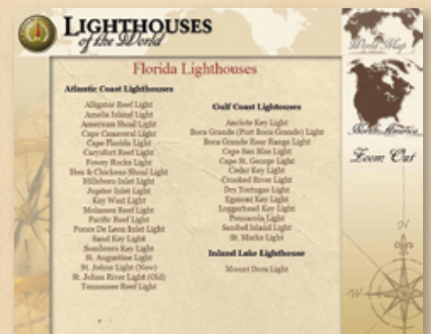
FLORIDA LIST PAGE