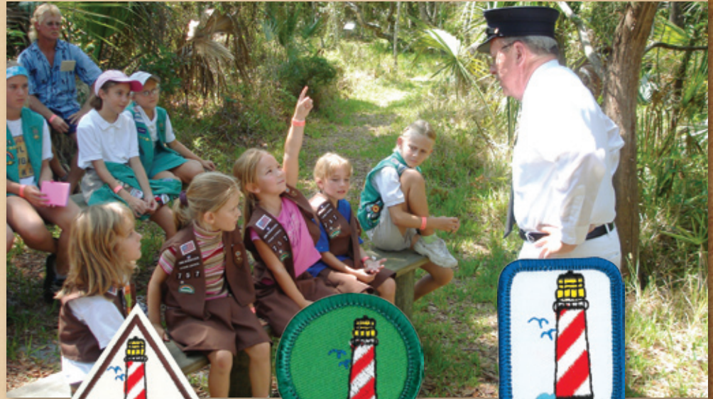
BROWNIE TRY-IT BADGE