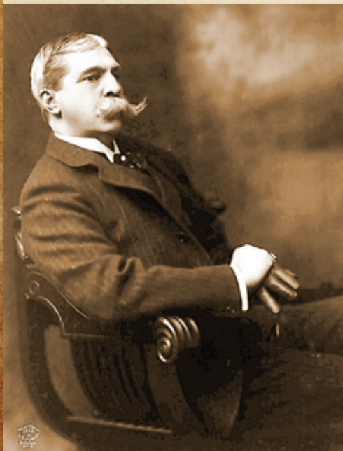
FRANCIS HOPKINSON SMITH

Smith was a popular after-dinner speaker, and as the years passed he began to put some of his more famous stories into print, resulting in his first book of