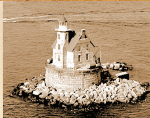
RACE ROCK LIGHTHOUSE