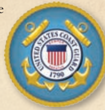
THE GREAT SEAL OF THE UNITED STATES COAST GUARD, AMERICA'S OLDEST MARITIME SERVICE.

States and collecting the appropriate taxes for each vessel based on its size, cargo, and port of origin (foreign vessels were charged an additional 10%). Established for the express purpose of "regulating the collection of duties" the Customs Service addressed its mission with an efficiency and dedication of purpose that would generate over 90% of the government's annual revenue for the next hundred years.