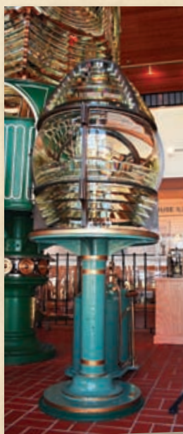
THE RESTORED CHANCE BROTHERS LENS IS NOW ON VIEW IN THE LENS EXHIBIT BUILDING.

Step one was the creation of an aiming chart for the lens. This would be the target for a laser light that would be shone through each prism. When the laser passed through the prism and landed on the center line corresponding to it on the aiming chart, the installers would know