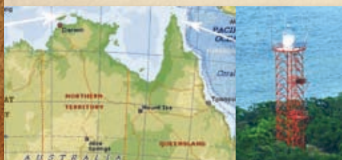
HANIBAL ISLAND AND CAPE DON; HANIBAL ISLAND LIGHTHOUSE