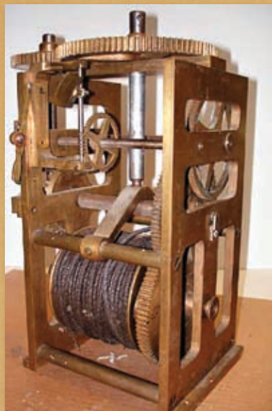
A THIRD ORDER CLOCKWORK MECHANISM HAS BEEN ADDED TO THE LENS EXHIBIT

A rotating lens was usually seated on ball bearings or chariot wheels. In some lighthouses, the lens would float in a basin filled with mercury. The clockwork mechanism that rotated the lens was powered by heavy weights that descended through the center of the spiral staircase or through a shaft located