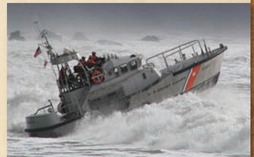
THE COAST GUARD CONTINUES TO PERFORM THE TIME HONORED MISSIONS OF THE U.S. REVENUE CUTTER SERVICE, THE U.S. LIGHT HOUSE ESTABLISHMENT, AND THE U.S. LIFE SAVING SERVICE TO THIS DAY.

duties in addition to those of the late Life Saving Service. This mission was expanded to include the construction, maintenance, and operation of all aids to navigation when the Coast Guard absorbed the United States Light House Service in 1939.