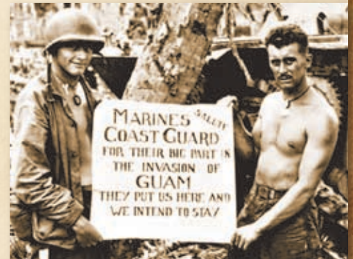
THE UNITED STATES COAST GUARD AND ITS PREDECESSOR, THE REVENUE CUTTER SERVICE, HAVE SERVED WITH DISTINCTION IN EVERY MAJOR AMERICAN CONFLICT SINCE THE NATION’S FOUNDING.