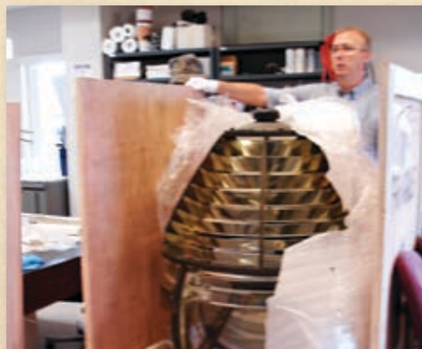
THE CHANCE LENS IS UNPACKED