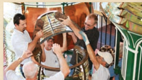
THE LENS IS LIFTED ONTO ITS PEDESTAL.

Areas that proved by appearance or by pH tests to be active bronze disease had to be cleaned and stabilized. Since the restoration team had decided to remove as little surface patina as possible, a method of removing bronze disease while keeping most of the patina intact had to be devised. This involved hours and hours of painstaking manual cleaning with picks, pins, wooden popsicle sticks, rags, and distilled water. Some rubbing with Never-Dull, a wadding polish, was done. The heaviest areas of bronze disease were found along the undersides of the lower section