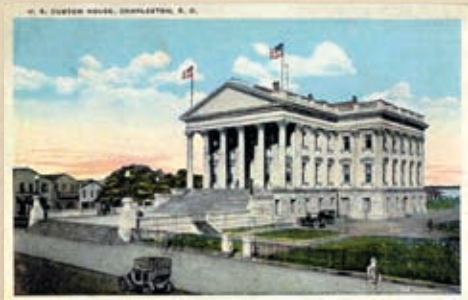
ALL SHIP MASTERS ENTERING OR EXITING THE UNITED STATES WERE REQUIRED TO REPORT TO THE CUSTOMS HOUSE. ALTHOUGH THE SIZE OF THE CUSTOMS HOUSE VARIED FROM ONE PORT TO ANOTHER, MANY WERE QUITE IMPRESSIVE, INCLUDING THIS ONE IN CHARLESTON, S.C.

United States Customs and Revenue Cutter Services were two of the first federal agencies formed following ratification of the U.S. Constitution in 1789. Unlike Thomas Jefferson's Democratic-Republicans, Hamilton and other Federalists promoted the idea of a strong centralized government and maintained that the future success of the United States resided not on the shoulders of the celebrated "yeoman farmer" but in the nation's budding manufacturing and maritime industries.