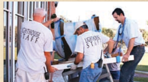
THE RESTORED CHANCE LENS IS MOVED TO THE LENS EXHIBIT BUILDING