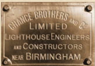
CHANCE BROTHERS NAMEPLATE

Before putting these new objects on display in the Lens Exhibit Building, it was decided that the lens would have to undergo some restoration and repair in order to preserve it in the best possible condition.