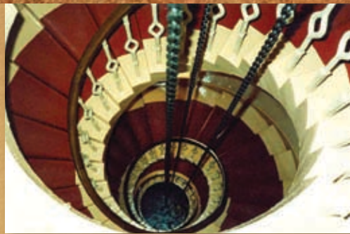
KINNAIRD HEAD LIGHTHOUSE, SCOTLAND, CLOCKWORK WEIGHT CABLES IN WEIGHT WELL

within the tower wall. When the clockwork weights completed their descent, the keeper at the top of the tower would crank them back up again. It was typical to set the speed of descent so that the keeper was forced to crank the weights up every hour in order to keep the lens rotating. This would ensure that the keeper remained awake throughout his watch.