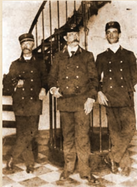
THE U.S. LIGHT HOUSE ESTABLISHMENT WAS RESPONSIBLE FOR CONSTRUCTING, MAINTAINING, AND OPERATING ALL AIDS TO NAVIGATION INCLUDING LIGHTHOUSES, BUOYS, AND CHANNEL MARKERS UNTIL BEING ABSORBED BY THE U.S. COAST GUARD IN 1939.

Founded four weeks after the signing of the Tariff Act, the U.S. Customs Service was the nation's first federal agency. Initially stationed at 59 mandatory ports of entry, Customs officials were given the responsibility of inspecting all vessels entering the United