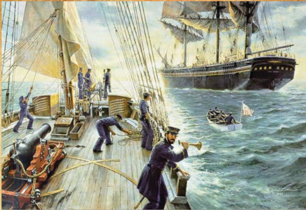
THE UNITED STATES REVENUE CUTTER SERVICE WAS AUTHORIZED TO SEARCH AND SEIZE ANY VESSEL OR CARGO SUSPECTED OF VIOLATING U.S. CUSTOMS LAW EITHER AT PORT OR AT SEA.

The Revenue Cutter Service performed its primary mission of enforcing customs laws with great efficiency and effectiveness. Signed into law on March 2nd, 1807, the Act to Prohibit the Importation of Slaves stipulated that any vessel suspected of smuggling foreign slaves into the United States would be subject to search and seizure by the proper authorities. By 1865, the U.S. Revenue Cutter Service had searched countless vessels suspected of transporting slaves and seized over 500 others including the infamous slaver Amistad by the Revenue Cutter Washington on August 26th, 1839.