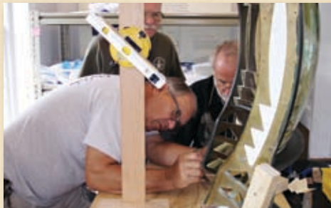
THE RESTORATION TEAM USE A LASER TO AIM THE PRISMS