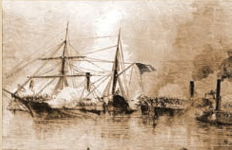
THE USRC Harriet Lane IS SAID TO HAVE FIRED THE FIRST SHOTS OF THE CIVIL WAR IN CHARLESTON HARBOR

Founded on the recommendations of the Secretary of the Treasury and fervent Federalist leader Alexander Hamilton, the