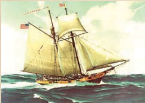
THE REVENUE CUTTER Massachusetts WAS ONE OF TEN SCHOONER-RIGGED VESSELS ORDERED BY SECRETARY OF THE TREASURY ALEXANDER HAMILTON. COMMISSIONED IN 1791 THE USRC Massachusetts PROVED ILL-SUITED FOR HER ROLE AND WAS SOLD THE FOLLOWING YEAR.