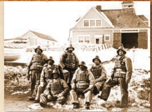
THE UNITED STATES LIFE SAVING SERVICE OPERATED LIFE SAVING STATIONS, LIFE BOAT STATIONS (PICTURED ABOVE), AND HOUSES OF REFUGE.

The United States Life Saving and Revenue Cutter Services functioned autonomously until the two were merged to form the United States Coast Guard in 1915. Essentially a continuation of the Revenue Cutter Service, the Coast Guard continued to perform all of its original Customs and maritime safety