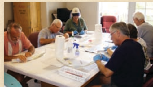
MUSEUM VOLUNTEERS UNDERGO TRAINING TO HELP WITH CHANCE LENS RESTORATION.